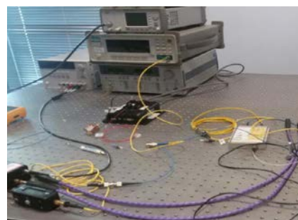
Fig.1 Optical set-up for the characterization of the photoreceiver