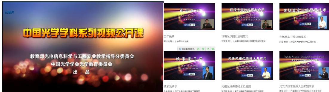
Figure 2 The information for the Open Class of Network Video for Optics/Photonics. http://hep.icourses.cn/zggd.html