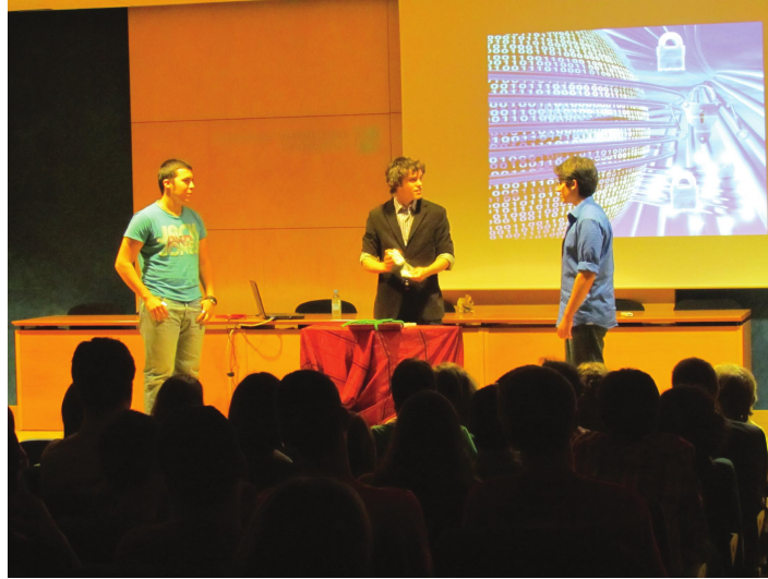
Figure 3. Having the audience involved in the show, during the CiMs-Cellex 15 talk.