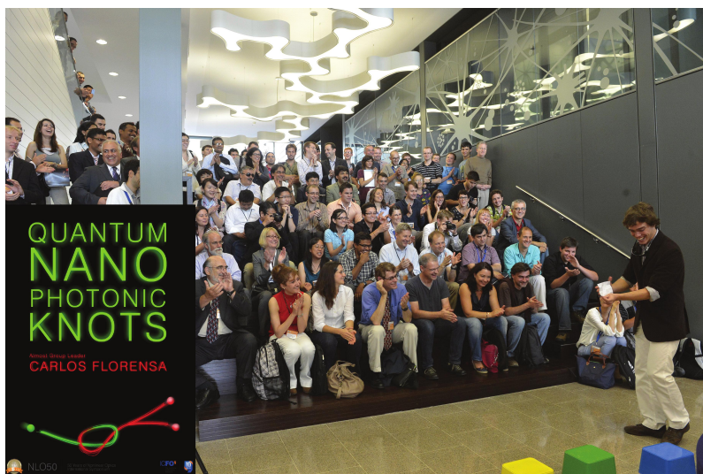
Figure 1. Performance for physicists during the NLO50. 3