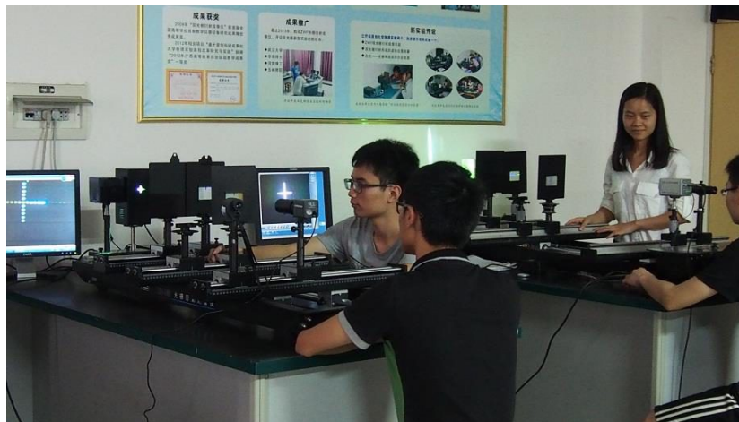
Fig.4 College students doing the experiments.

Since 2009, 8 sets of ZWP grating diffraction instrument have been employed in new experimental courses in our university. Fig 4 showed our college students doing experiments. The new experiments have been praised by students and peer experts in China. Currently, the instrument and our new experiments have been extended to the other universities.