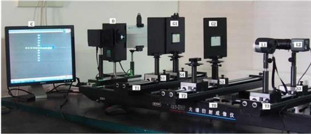
Fig.3 ZWP Grating Diffraction Imaging Instrument.

instrument was designed by us, which can be used in the new grating experiments. This instrument consists of three parts (figure3).